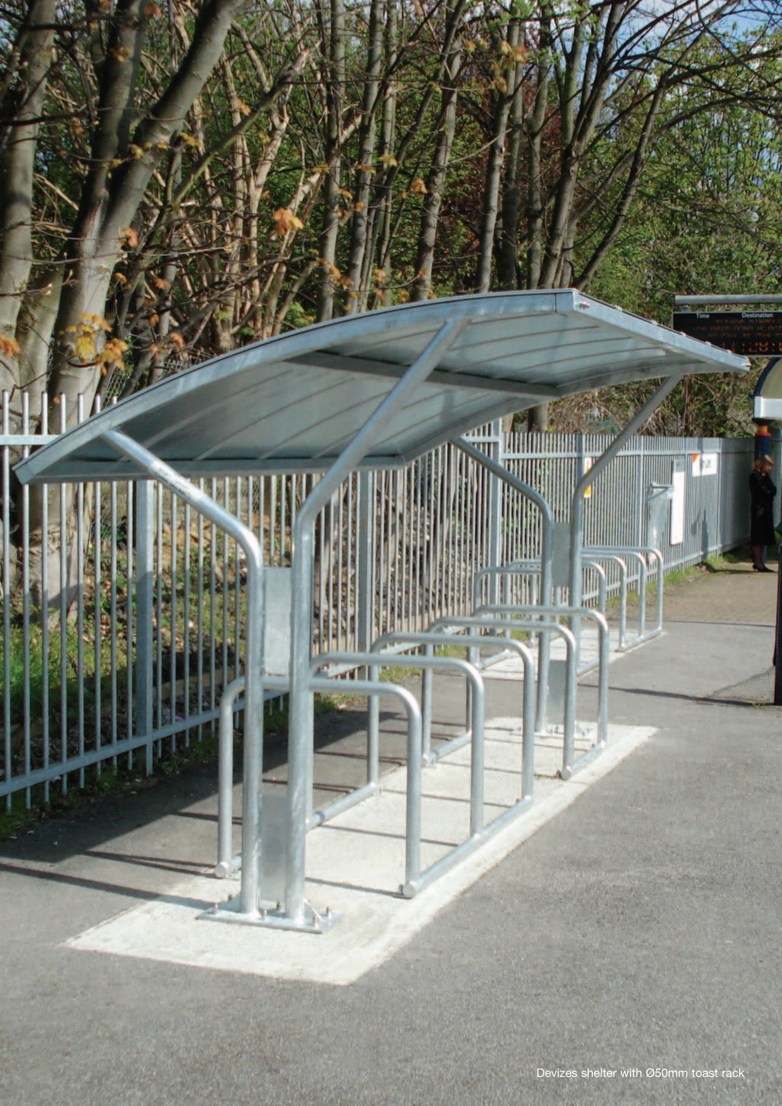
Devizes shelter with Ø50mm toast rack