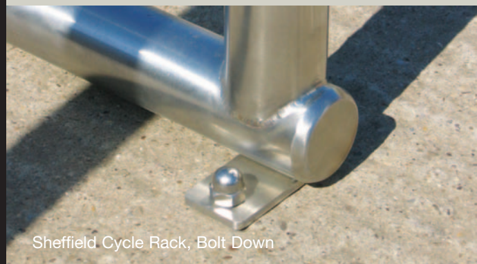
Sheffield Cycle Rack, Bolt Down

Alternative cycle stands, such as the 'cycle pin' and a bespoke design service are available upon request.